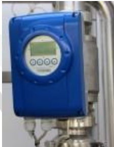
Variable flow rate