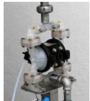
Automatic heating and dosing