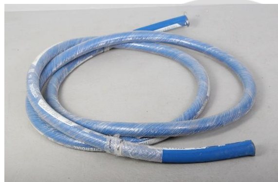
P038TR 38mm diam. reinforced hose. For different lengths of hose contact us.