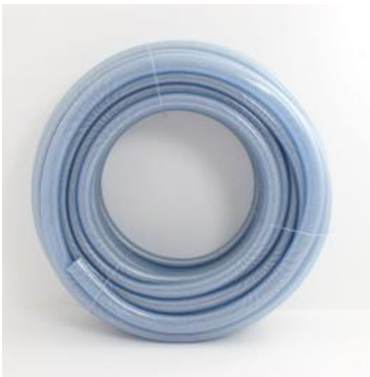
P038TT 38mm diam. Tricocclair hose. For different lengths of Tricocclair hose contact us.