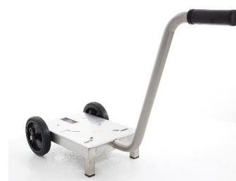
measurements in mm