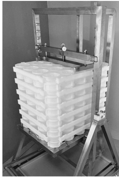
Bottom mold block